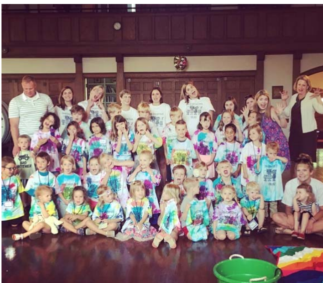
VBS Volunteers and Kids