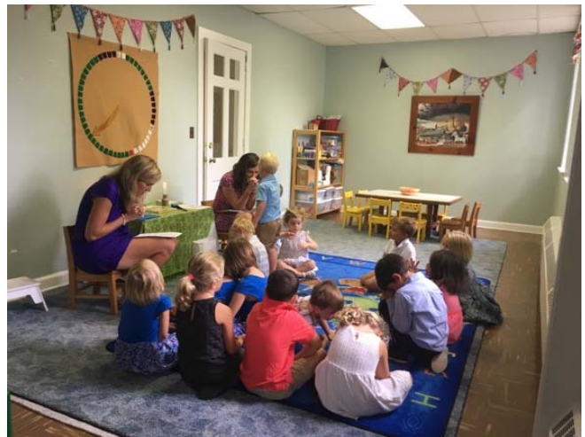
Children's Chapel Volunteer Leaders