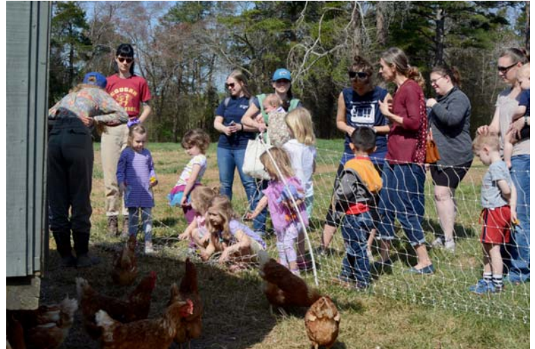
The Christ Church Preschool enjoyed a recent field trip to Bellair Farm!

May 31 CEC Choir and guest singers from St. Paul's Ivy, St. Paul's Memorial, Grace Episcopal Church – Franz Schubert "Mass in G" with choir, orchestra and soloists.