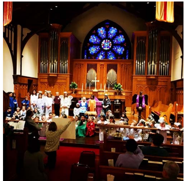
Christmas Pageant Volunteers