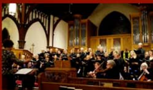
May 31 - SCHUBERT MASS in G Church choir members from Christ Episcopal, Church of our Savior, Grace Church Keswick, St. Paul's Ivy, and St. Paul's Memorial with Chamber Orchestra