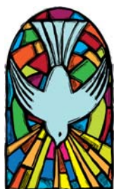
Stained Glass Window Book For Sale

Severe storms and flooding have battered regions of the U.S. since April. If you would like to help those in need, you may contribute through Episcopal Relief and Development fund. Mail your contribution to P.O. Box 7058; Merrifield, VA 22116-7058. Checks should be made payable to: Episcopal Relief & Development . Visit www.er-d.org for updates.