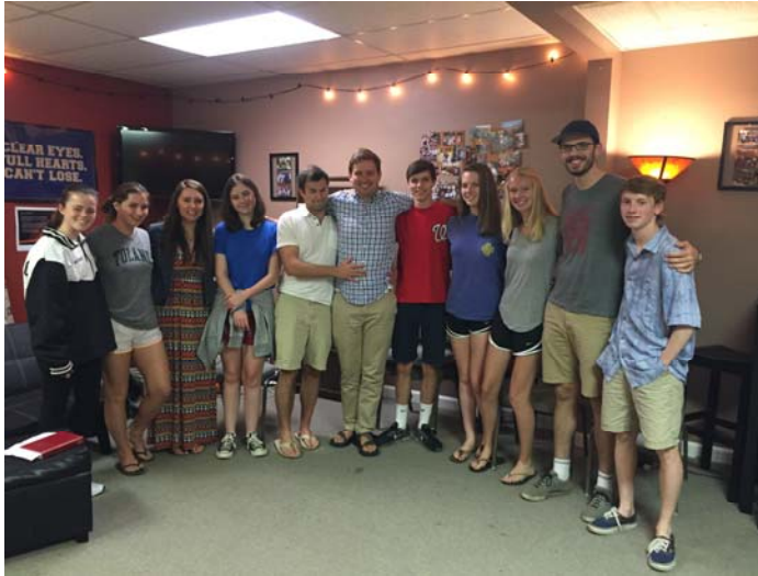
Photo: Last night of Youth Group