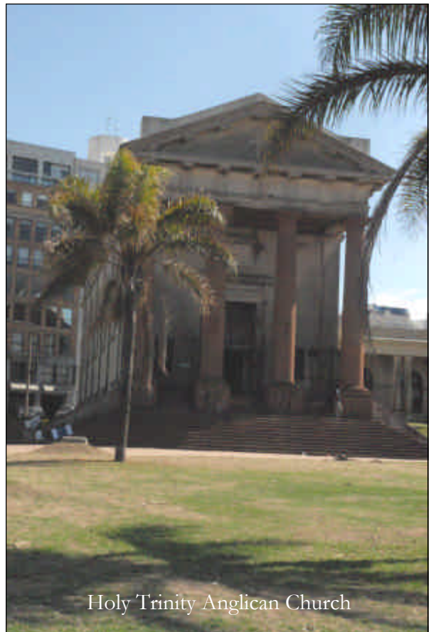
Holy Trinity Anglican Church