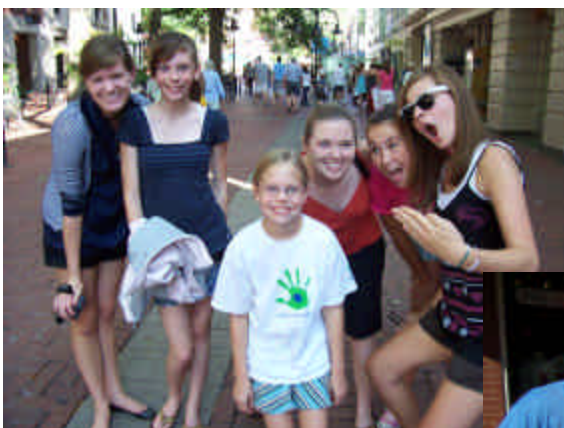
Middle School Video Scavenger Hunt Sept. 13